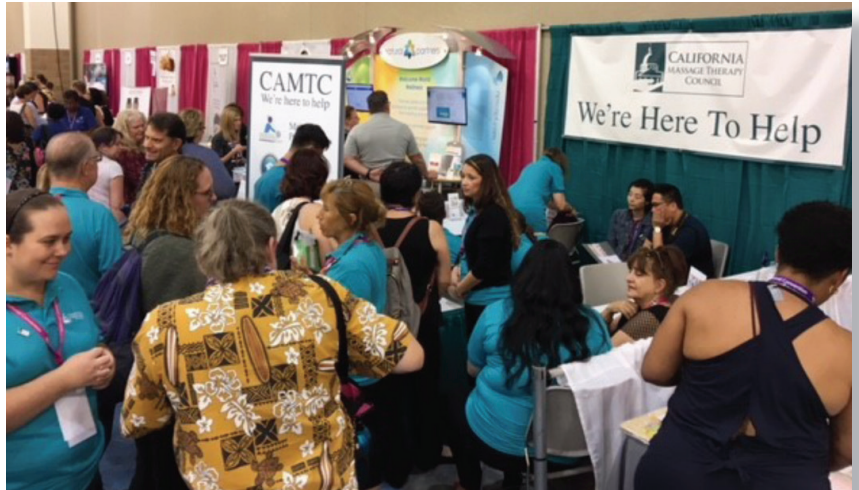
CAMTC booth with staff helping attendees.

Among school topics discussed were foreign education, starting a school, buying a school, timelines for schools on the pending list, qualifications for teaching massage in California, and receiving investigative information about school fraud.